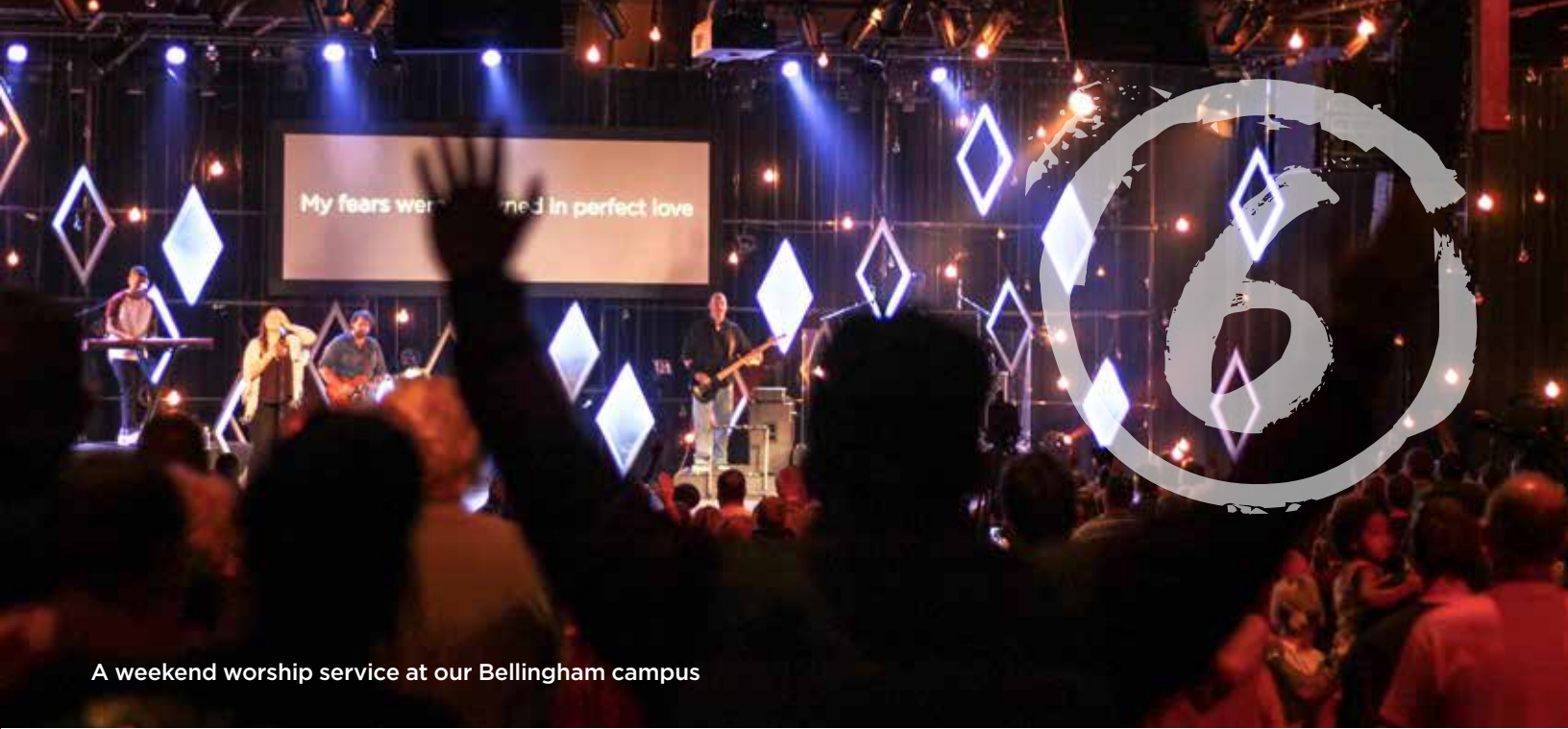
A weekend worship service at our Bellingham campus